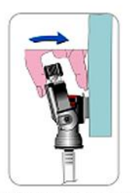
Place the tap inside the connector Push (pivot) to close the connector